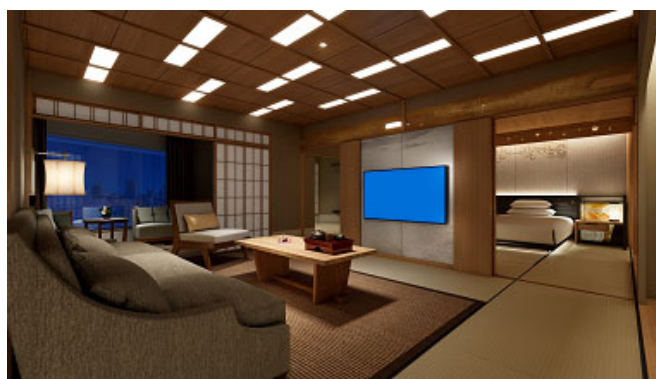
Sample image of the new Japanese Room (120 m 2 )

The guest room concept of Hotel Gajoen Tokyo is "Wakei Seishin" which seeks for natural beauty in serene and calming simplicity. The design incorporates modernity with the Japanese spiritual worldview of Wabi-sabi as in Japanese tea ceremony rooms, as well as the thought for nature and the Japanese sensibility to lighting. As a part of the makeover, the headboard inspired by traditional folding screen used in the tea ceremony is installed, to welcome the guests with traditional Japanese patterns and flowers. The walls of the bedroom are decorated with Yabukoji, a plant often seen on the path to the tea ceremony house. The bed ensures comfort and a good night's sleep for all guests.