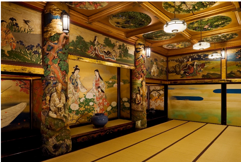
The Gyosho Room

[Tokyo, 30 October 2018] Hotel Gajoen Tokyo (operated by K. K. Meguro Gajoen, Address: Meguro-ku, Tokyo) a Museum Hotel of Japan Beauty, is pleased to announce a special event, “HYAKUDAN KAIDAN EXHIBITION – Glory of Japanese Art”, which will take place from Thursday 29 November until Monday 24 December 2018, in commemoration of 90 th anniversary year of the hotel. The event will take place at “HYAKUDAN KAIDAN”, a historical wooden building in the hotel site, which has been designated as a Tangible Cultural Asset of Tokyo.