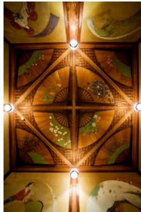
◆ The Kiyokata Room