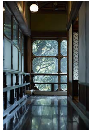
◆ The Kiyokata Room (Corridor)