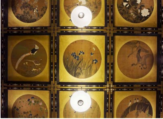
◆ The Jippo Room