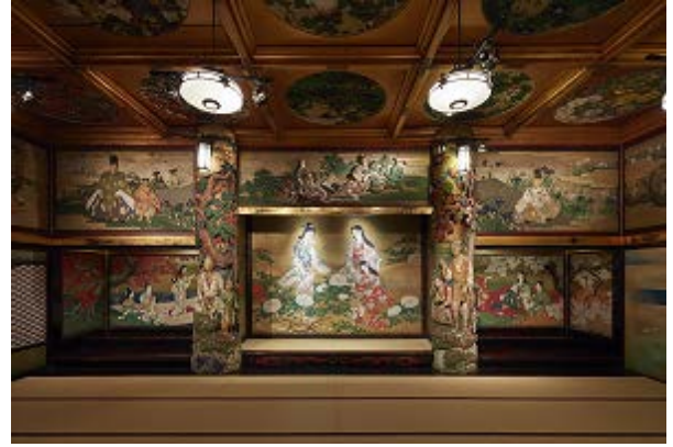
◆ The Gyosho Room