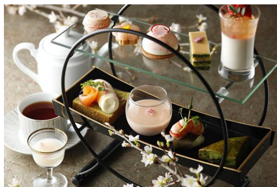
Sakura Afternoon Tea